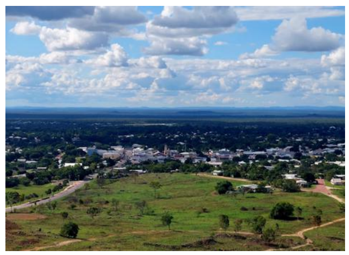
Town View from Towers Hill