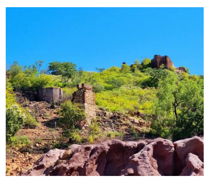
Old Gold Mine Area