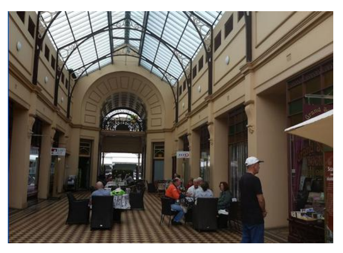
Old Gold Exchange Building

Charters Towers is a rural town in the Charters Towers Region, Queensland, Australia. It is 136 km by road south-west from Townsville on the Flinders Highway. During the last quarter of the 19th century, the town boomed as the rich gold deposits under the city were developed.