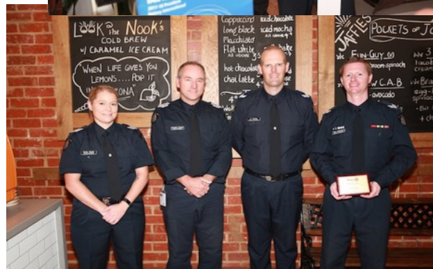
Pictures from Last Week's Meeting The Police Person of the Year Award