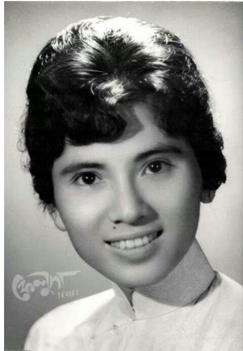
A Young Mother Teresa