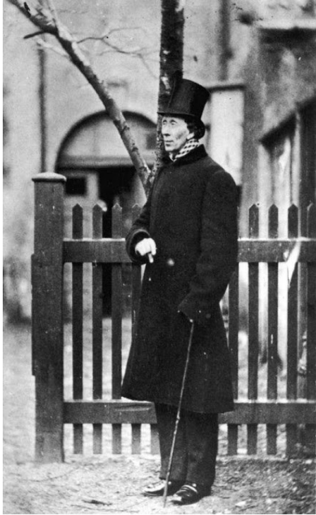
Hans Christian Anderson