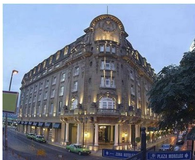
Gamma de Fiesta Americana Monterrey Gran Hotel Ancira