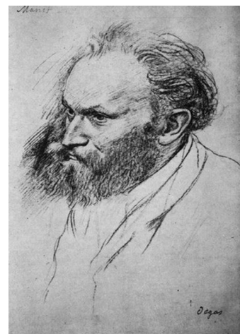
To buy Degas

We are on the web www.sunburyrotaryclub.org.au