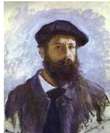
I had no Monet